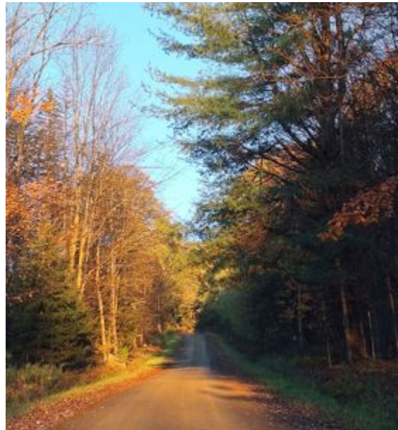
The glow from Brother Sun coming up over Roberts Rd towards the Mountain a little after sunrise!