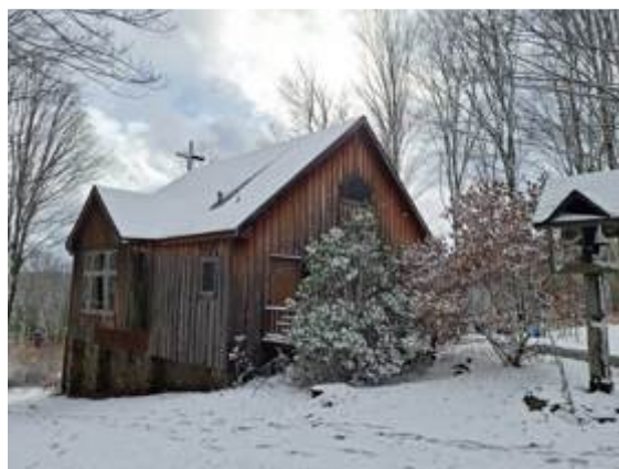
Our first coating of snow this year!