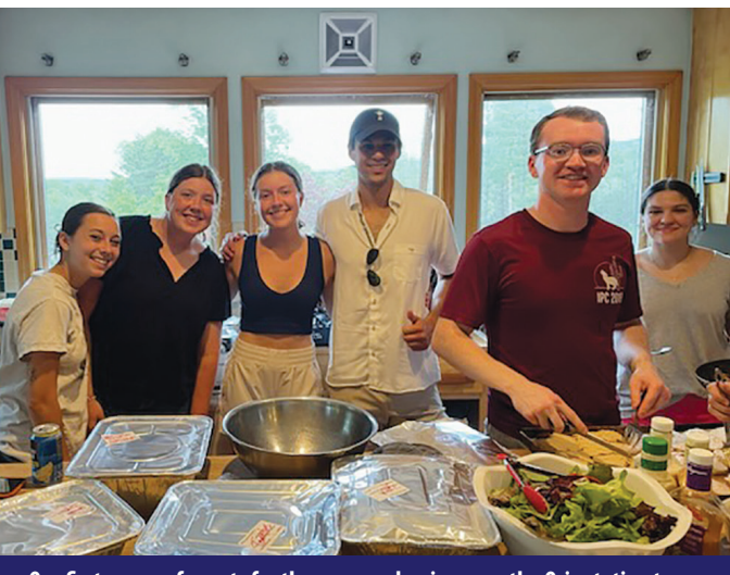
Our first group of guests for the new academic year – the Orientation team came for prayer, good food and bonding.