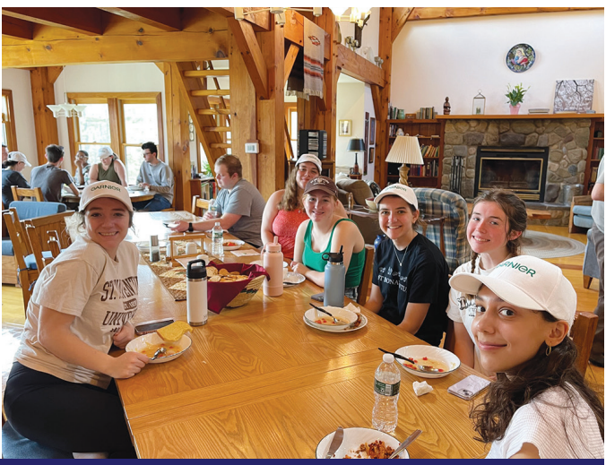
Our friends and family gathered for a good meal during our "work and prayer" day.