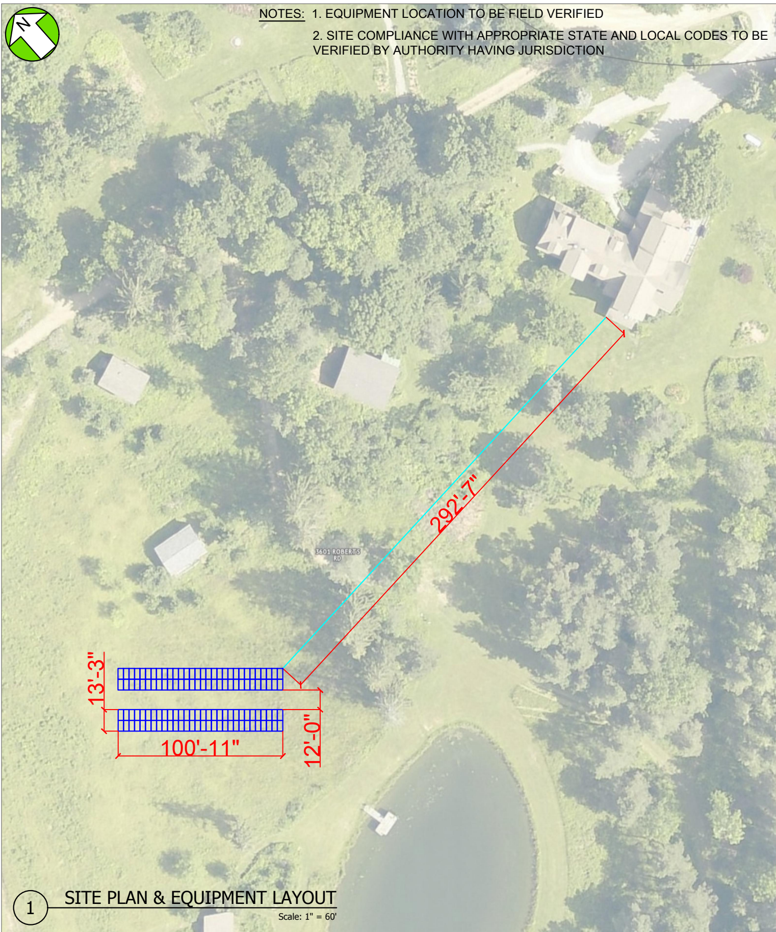
1 SITE PLAN & EQUIPMENT LAYOUT Scale: 1" = 60'

NOTES: 1. EQUIPMENT LOCATION TO BE FIELD VERIFIED 2. SITE COMPLIANCE WITH APPROPRIATE STATE AND LOCAL CODES TO BE VERIFIED BY AUTHORITY HAVING JURISDICTION